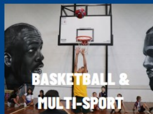
BASKETBALL & MULTI-SPORT

The perfect class to learn how to play sport. These classes will help children develop the fundamentals and skills of the sport. These classes are designed for young people that have never played a sport before and would prefer to ease their way into it.