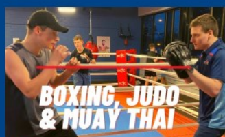
BOXING, JUDO & MUAY THAI

Gymnastics is for everyone! With a range of programs devised to help develop incredible skills for fitness, performance, competition or just to challenge yourself.