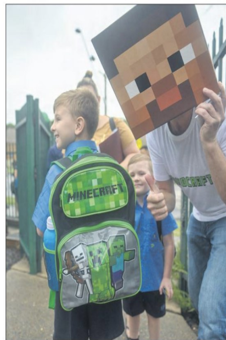
The 'Minecraft' inspiration on display at St Joseph's Primary School last week.

We are all looking forward to a positive and predictable 2021. My hope is that we will soon all be able to gather as a school community - students, teachers and parents all celebrating together. Until then, we'll continue to share pictures and stories about what is happening here at St. Joseph's.